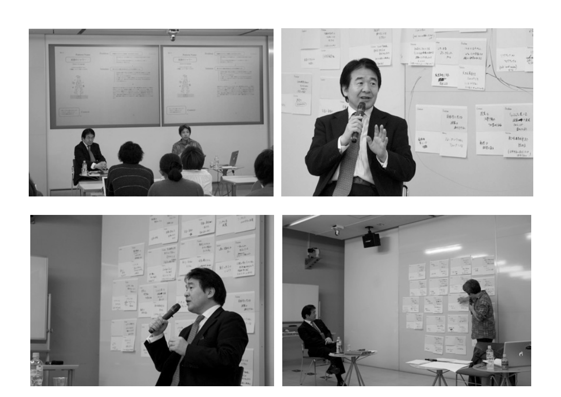
Figure 1 Mining Interview with Heizo Takenaka