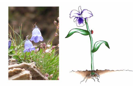
Figure 2. Example for Optimize Object Perception

Left: a photograph showing flowers in a realistic environment Right: The illustration shows a flower reduced to less detail. Also from this viewpoint the flower has a canonical silhouette.