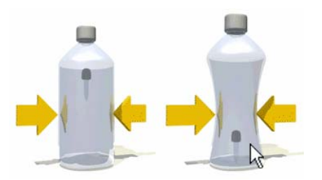
Figure 6. Example for Switch Between Object States

Moving the mouse over the image replaces it by another image. The image component switches itself between visual states.