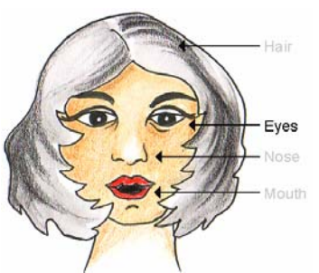
Figure 3: Diagram for Optimize Object Perception