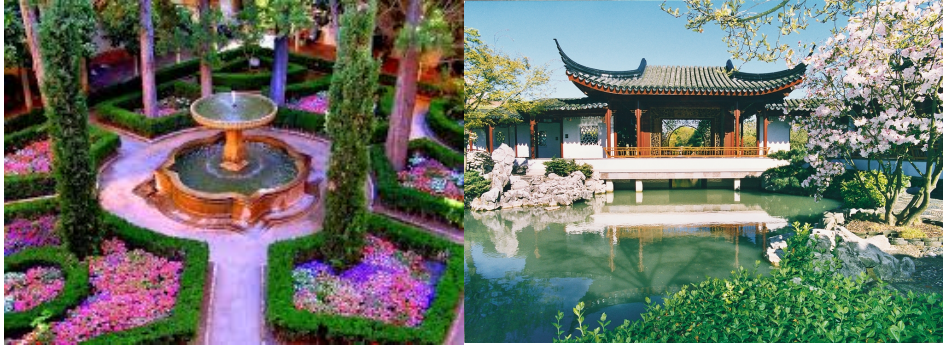
Figure 3 Spanish and Chinese gardens

We used the Garden Patterns to illustrate a visual learning with patterns and languages. When we say a Spanish garden, we immediately have an idea of the model of a Spanish garden as opposed to a Chinese garden, which is based on the 14 essential garden patterns previously listed; the use of water is very different in the two different gardens: