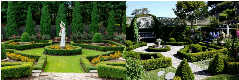
Figure 4 Italian and French gardens

This is from the Latin cluster sound ct pronounced /kt/. In Italian tt, French it, and Spanish ch.