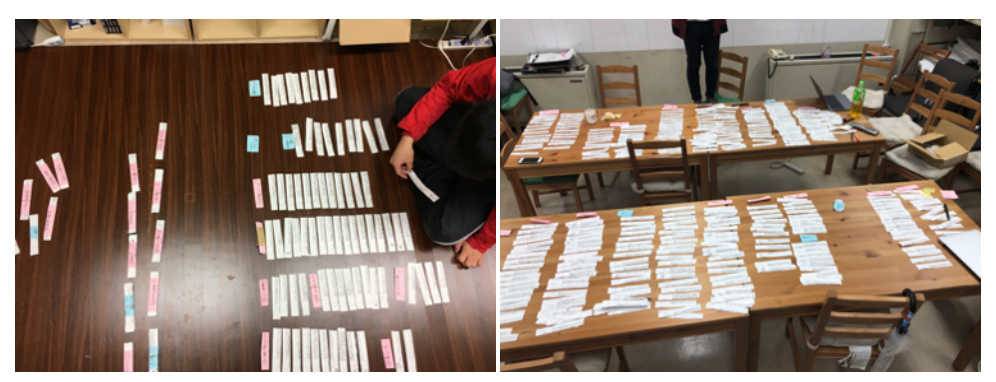
Figure 5: Categorizing 390 Style Seeds and Created 14 Themes

Then, we organized and grouped the style contents by spreading them out and bringing similar styles closer (Kawakita, J., 1967). As a result, we could find that 390 styles can be created 14 themes. For each theme, we put a symbolic name that can represent contents of styles. For instance, the collection of styles for creating family's own way of living is the theme of "Family's World" and the collection of style for ideas to have a lively conversation is the theme of "Invitation to a Dialogue" (Figure 5).