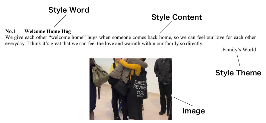
Figure 2: The Format of A Style Language for Family Lifestyle

Currently, A Style Language for Family Lifestyle includes 390 styles of living under 14 themes. Each style consists of a sentence describing the style word, the style content, and the theme. Some examples of styles are shown below. Style Word symbolizes its content on the upper left with bold letters. Style of the family, Style Content, is written as an episode in the middle. Style Theme which style aims to achieve is written in the right bottom (Figure 2).