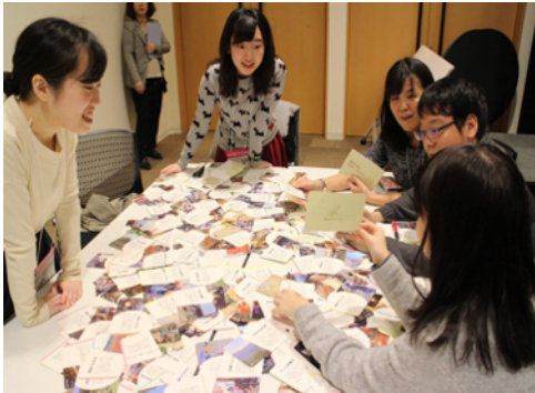
Figure 8: The Chatting Workshop with using A Style Language for Family Lifestyle at Open Research Forum 2017

After holding the Chatting Workshop, participants said these of following: