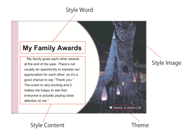
Figure 6: The Layout of the Style Card

By putting 14 different colors in the cards depending on the themes, that makes participants to recognize each theme easily. In addition, 390 cards with 14 colors are mixed and fill on the table, we assumed that this colorful table will demonstrate and symbolize diversity (Figure 7).