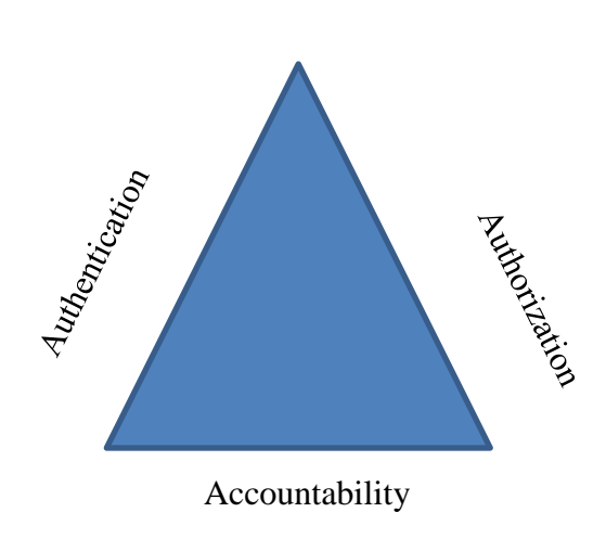
Figure 3 Three most important security pattern goals