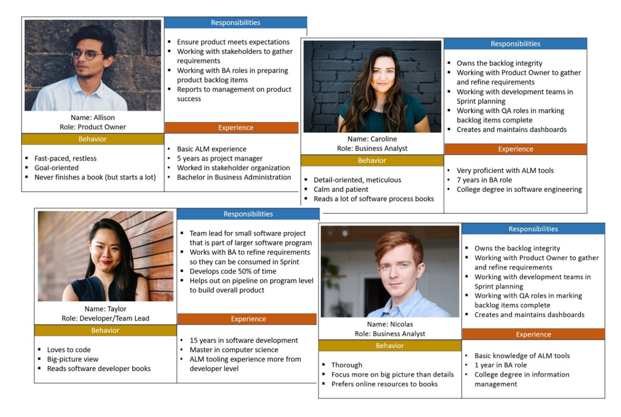
Figure 2 Persona Cards

We found all these reader personality types among the people who responded to the survey. Bringing together the three dimensions of user characteristics we created four personas as shown in figure 2.