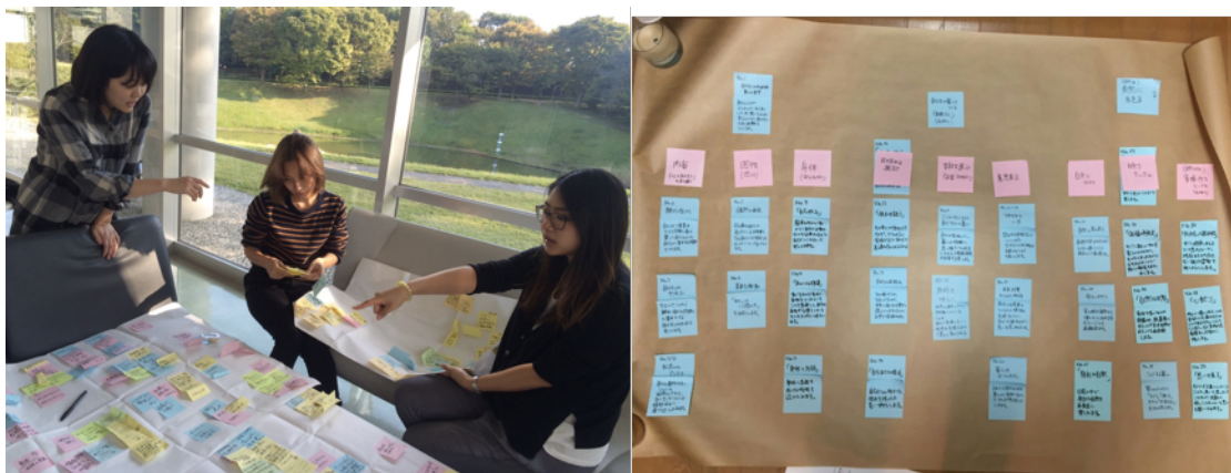
Figure 2. Clustering the pattern seeds by KJ method

We were able to group the pattern seeds through this process, which became the outline of patterns of the Natural Life Patterns. Creating a network-like structure between the groups by relating the groups to each other made the patterns into a language form. The overall structure is presented in the following section.