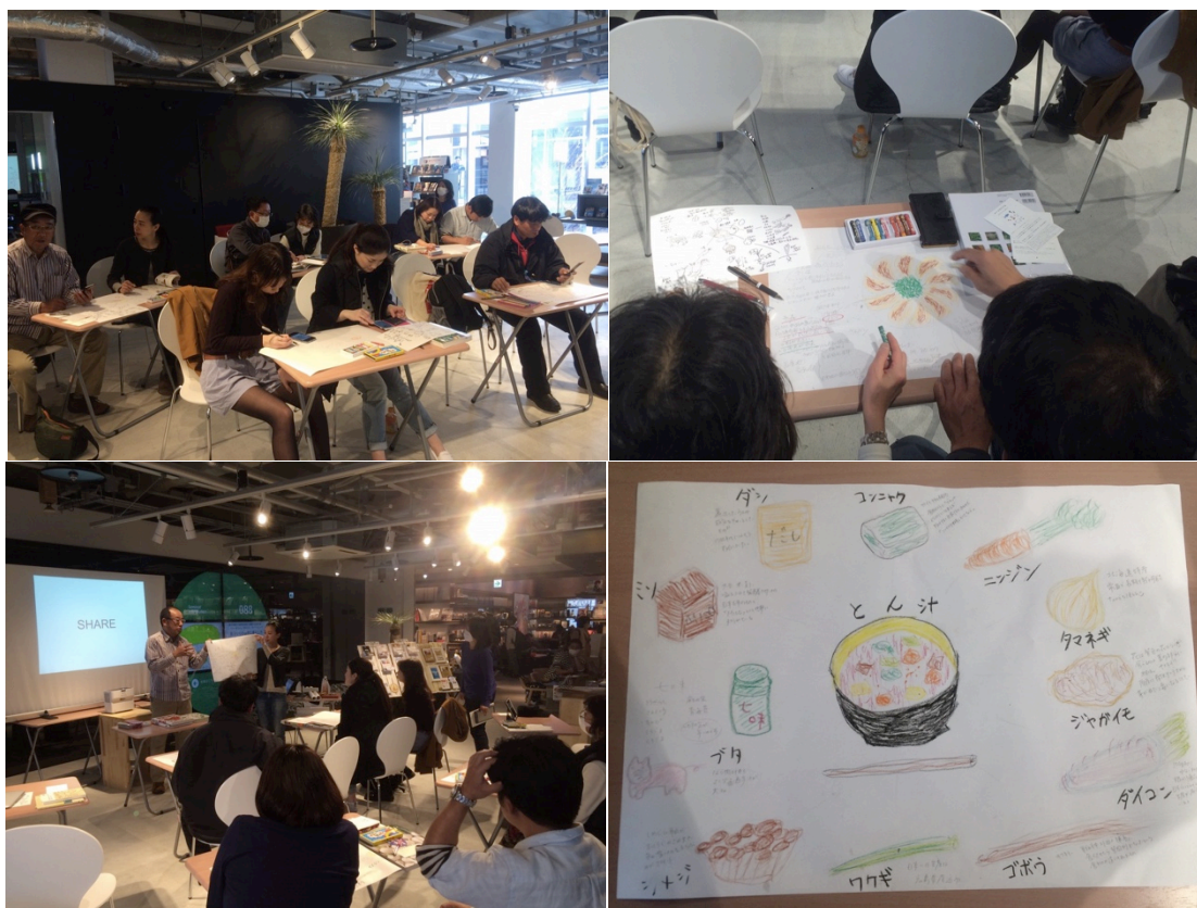
Figure 6. Workshop, 2016/03/05@Syonan T-SITE, D-LABO

As a way to deepen the understanding of Natural Living Patterns, we conducted a workshop mainly focused on the pattern Follow the Roots (Figure 6). The purpose of this workshop was to pay more attention to the background of things we use, food we eat, and clothes we wear unintentionally in daily life. By recognizing the people behind the production of things as well as nature resources being used, we can realize the connection between our lifestyle and the Earth.