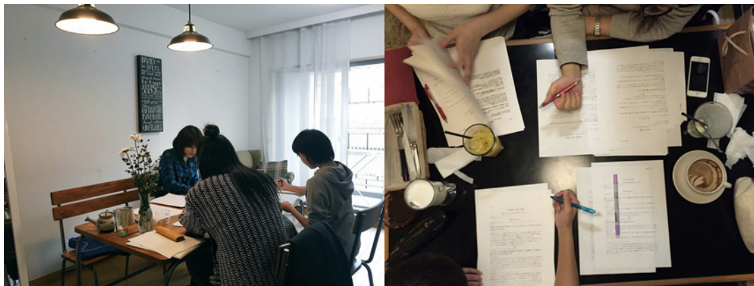
Figure 3. Writing and revising the patterns

After clustering, we wrote out the patterns in detail. Each patterns explained what kind of context it underlies, the problem that often occurs under the context, a solution hint to the problem, and the consequence that explains the result. With force supporting the problem and action supporting the solution, it helps the reader understand the problem further and is able to take the solution into action easily.