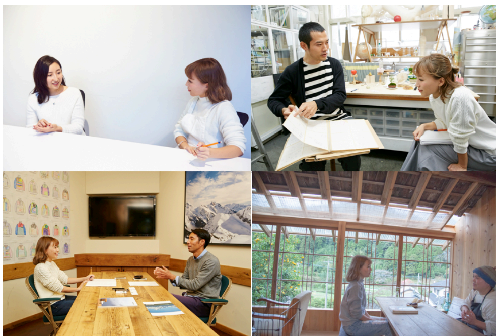
Figure 1. Interviewing people who lead an ethical and sustainable lifestyle

In the beginning, we expected interviewees to be highly conscious of environment or society, and thus practice the ethical & sustainable lifestyle from the sense of duty. However, we found out through the interview that they recognize the hidden connection between human and nature and build comfortable relationship with surrounding people and nature. To do so, they make effort to find the value standard for one's self and create an original lifestyle based on one's value standard rather than common sense or economic rules. We changed the name of the pattern language from Sustainable Lifestyle Patterns to Natural Living Patterns through this discovery. It is closer to the idea of practicing the natural lifestyle for human and nature rather than practicing the lifestyle with the consideration of sustainability.