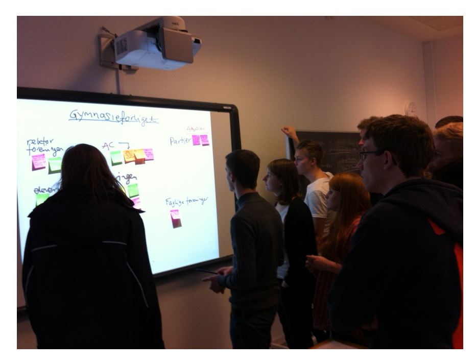
Fig. 3: Students in a social science class who are using various technologies to discuss their ideas