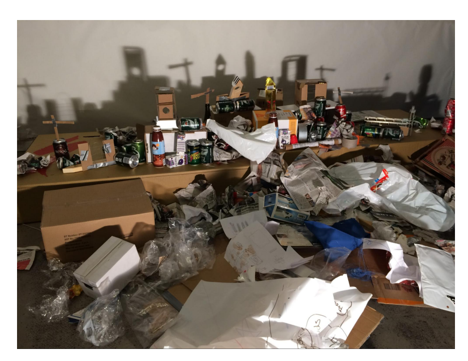
Fig. 5: Student project using waste collected around Aarhus to recreate the city's skyline

In one example the students were trying to create awareness of the problems of waste in cities by collecting actual waste, arranging and exhibiting it as the skyline of the city in question. They collected the waste they found scattered around from the city center of Aarhus and arranged it in such a way that it shows the fast evolving silhouette of the skyline when being highlighted by a portable projector. For example the photo in Figure 3 shows the actual arrangement of the skyline of Aarhus – the second largest city in Denmark. The projection shows the town hall tower, the art museum ARoS and three tower cranes. The work was done by students under the supervision from a Danish artist.