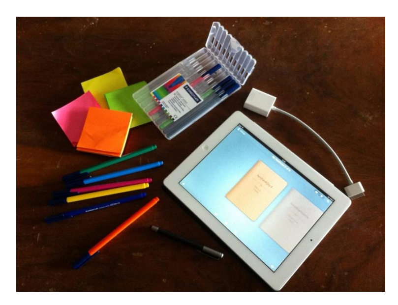
Fig. 2: Tools that students can use to express their ideas and drive class discussions

In a social science class, discussion is a central learning activity. Technical obstacles such as interactive whiteboards that don't afford collaborative, synchronous writing, and the classic arrangement of the classroom with the teacher in front of consecutive rows of students facing the teacher can have a detrimental effect on participation and level of engagement in classroom discussions [Rosenfield et al. 1985]. The example in the photos show a combination of different technologies that were utilized to bypass and circumvent the inherent obstacles. Graphical representations of the topic (political decision-making processes) scaffolds and structures the discussion. Sticky notes, pens, and a tablet with a simple sketch-app were used to motivate the students by letting them take control of the discussion. These technologies helped de-center the teacher and made room for students to leave their row of chairs and take part in the discussion. The role of the teacher was to observe and act as a secretary for students when they decided to have a heading written or moved around on the interactive whiteboard. Another input device (the tablet) was transformed to a remote writing station. The students wrote on sticky notes and placed them on the now vacant screen.