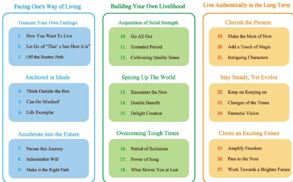
Figure 1: Overview of “A Pattern Language for Nurturing an Exciting Life”

Cultivate your Own Path and Create a Life with Creativity and Excitement