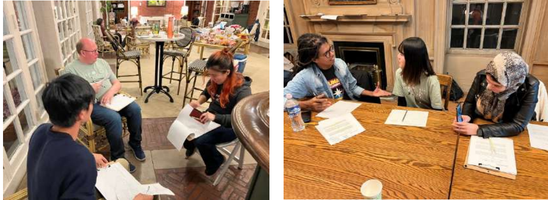
Figure 2: Role-Playing as interviewer and interviewee in Teams of Three