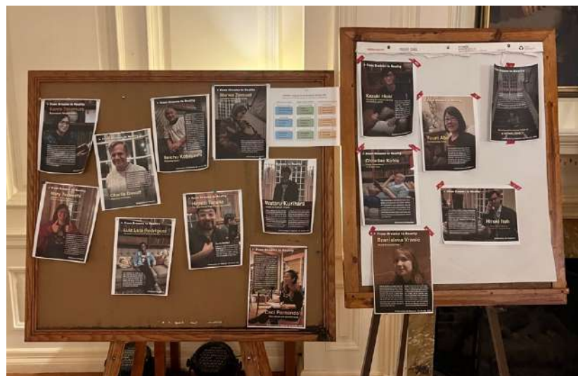
Figure 4: Display of the Articles