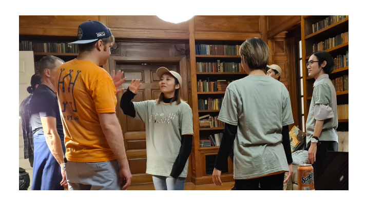
Figure 6: The Mirrors scene (the final rehearsal).