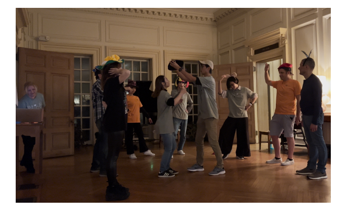
Figure 3: The Fashion Designer scene (performing).