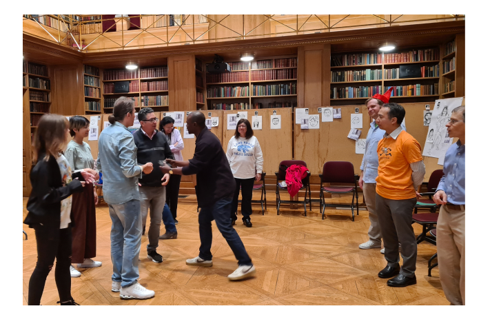
Figure 2: The Stolen Wallet scene (building the drama play).